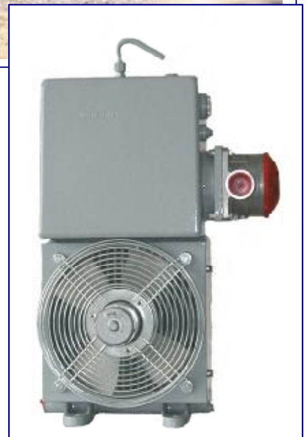
OIL COOLER AKG 1053.127.0000