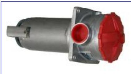
OIL FILTER (complete) AKG 8061.001.0000